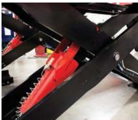
Dual hydraulic cylinders