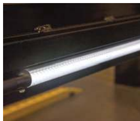
Automatic LED lighting